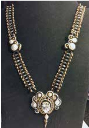
Pendant with Necklace