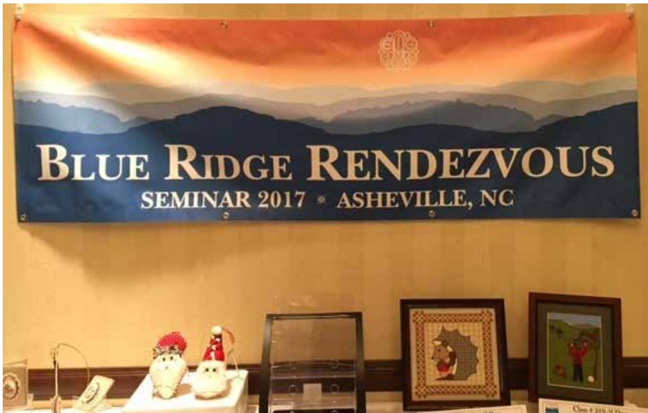
BRR banner with some of the Seminar 2017 class offerings, displayed at Alexandria.

Visit http://bit.ly/EGA2017Seminar for all the details. ●