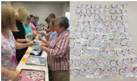
Last year's "bead party"

We are very excited about our Lite region seminar this year. Hopefully you and your chapter members have received the brochure along with the registration form. Fun and work along with more fun is the theme. As we prepare to host EGA National Seminar 2017 in Asheville, NC our "Work Parties" will be a buzz finishing table favors, nametags, etc. (no bead counting this time). Don't miss the bargain prices for registration this year. This is a limited time offer and we will return to regular prices in 2018.