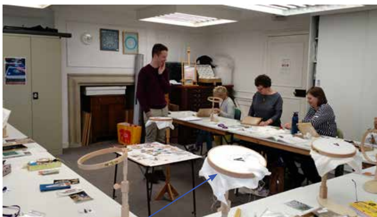
Mine! (early days, padding only)