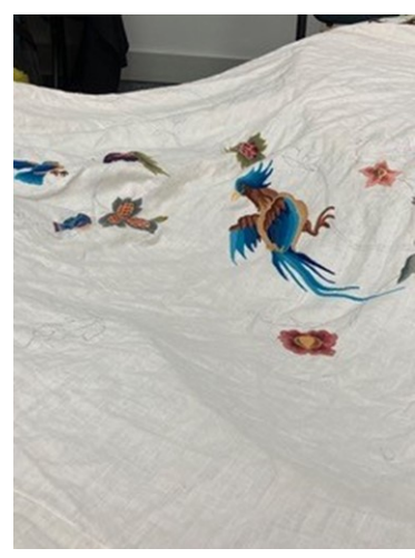
This is Susan MacRae's 'petite' project when it is out of its pillow case!