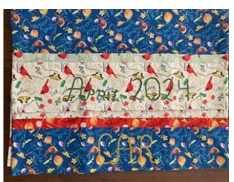
The 2nd case has a white North Carolina cuff, a light green Virginia strip, & a blue case of South Carolina. Virginia & South Carolina border North Carolina.

North Carolina border South Carolina. Carolina border North Carolina . "CAR" was chainstitched on the South Carolina fabric. "April 2024" was chainstitched